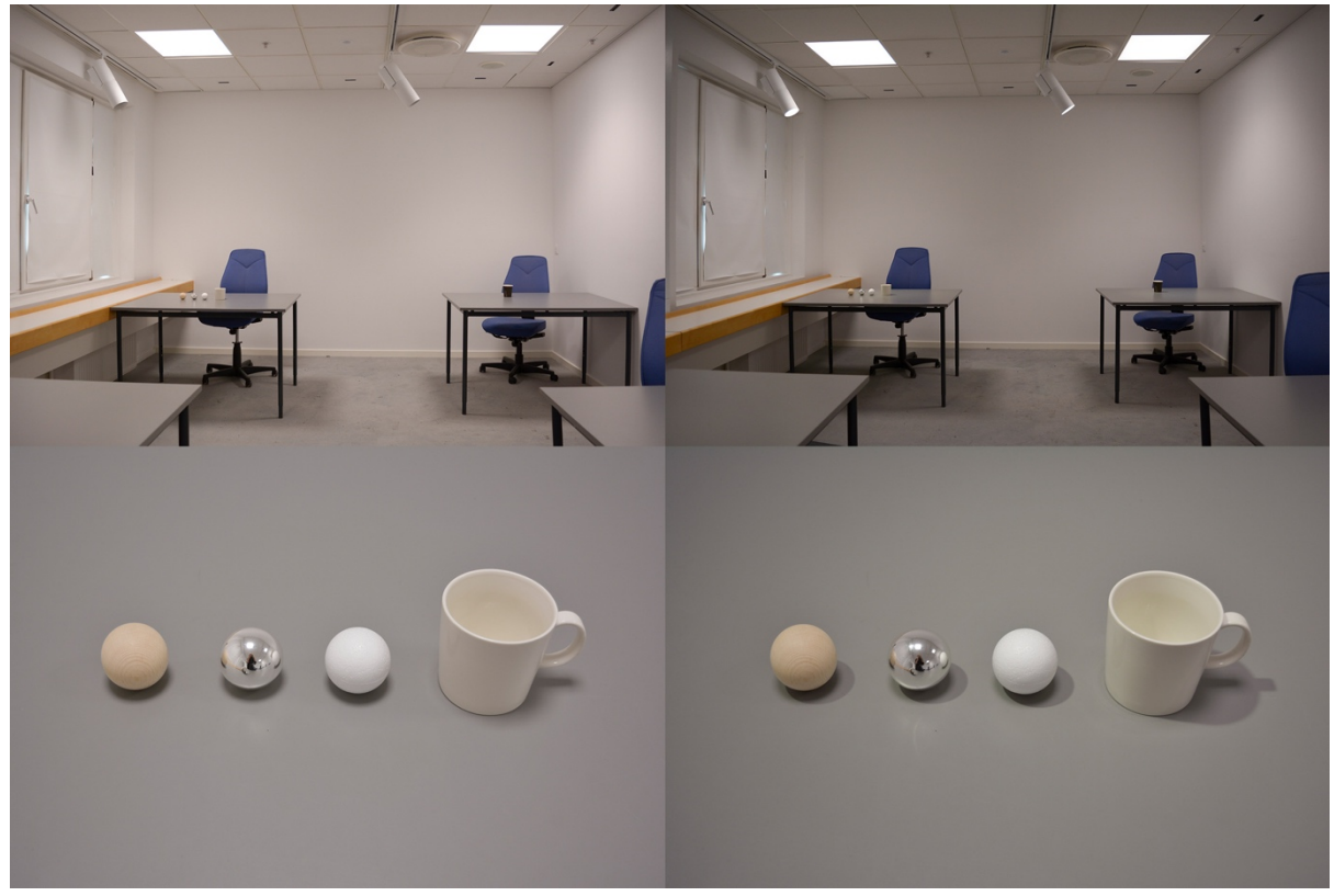
Fig. 1: The two photographs are showing the visual appearance of the space and difference of light modelling of objects with only diffuse lighting 0:100 ratio (on the left) and 45:55 ratio of direct: diffuse lighting (on the right). See Research Paper 3.