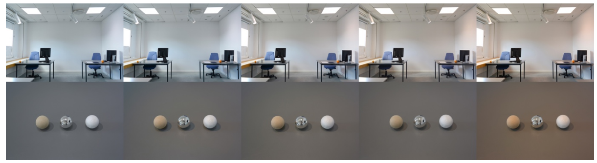
Fig. 2. Registrations of 5 different lighting settings, illustrating the light distribution and perceived CCTs of the space and of objects on a work desk. See Research Paper 3.