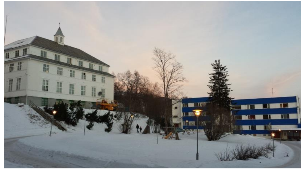
Trondheim and Heimly reception centre.